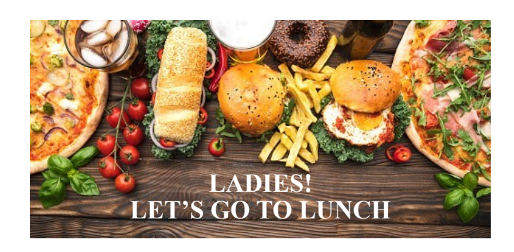
Bravo Café May 18, 2024

As a father holds his crying child to his cheek when he gets a vaccination or gets hurt, the child quits his crying. God does the same with us when we go through troubled times, when we are hurting, when we are crying because of pain. He holds us to His cheek to comfort us through the situation we are going through.